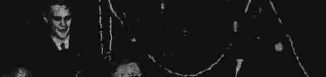
President Roosevelt and his seven grandchildren are shown with their Christmas tree at Hyde Park, N. Y., Christmas eve...